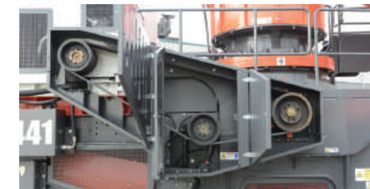
Direct drive for maximum fuel efficiency