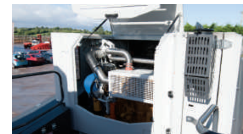
Easy access to the engine compartment