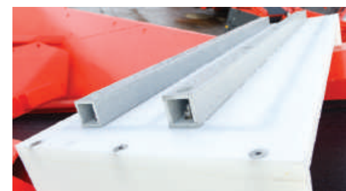
Bridge coil metal detector for controlled detection