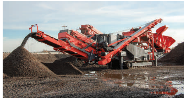
Available with optional hanging screen system.