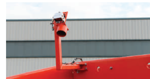
Camera and level sensor to ensure continuous feed