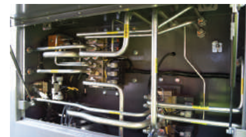
Steel pipework for better heat dissipation