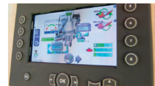
User friendly PLC control system with colour screen