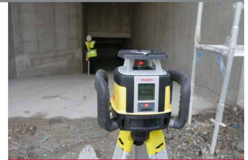
HORIZONTAL, VERTICAL & FULLY-AUTOMATIC DUAL GRADE WITH DIAL-IN