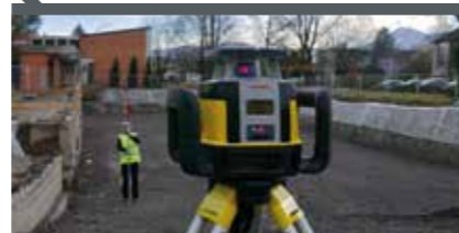
GRADE WITH DIAL-IN