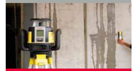
HORIZONTAL ONE-BUTTON LASER