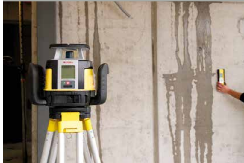
HORIZONTAL ONE-BUTTON LASER