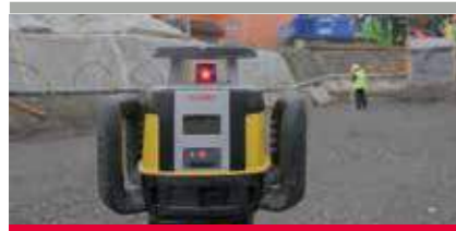
HORIZONTAL ONE-BUTTON LASER