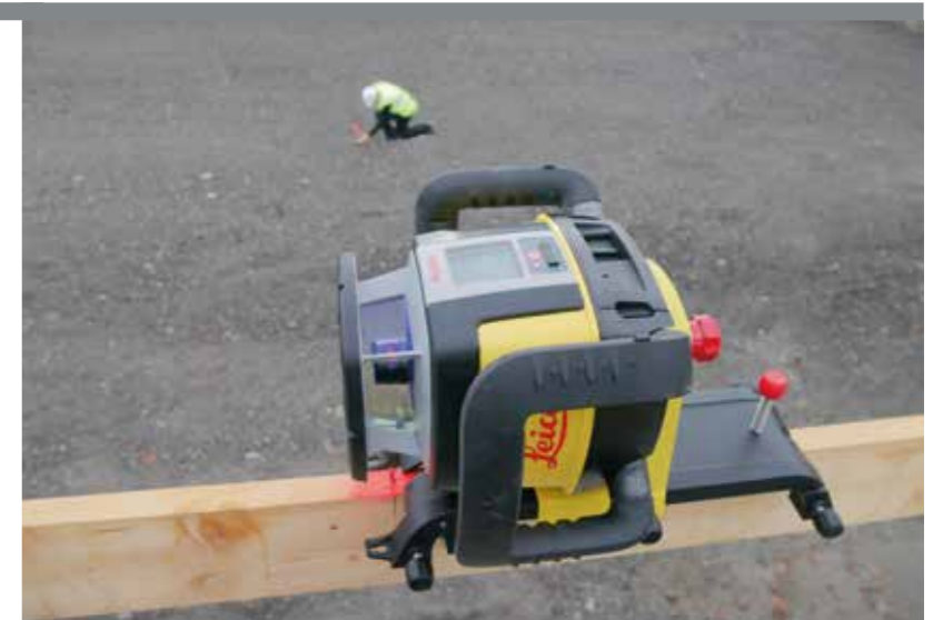
HORIZONTAL, VERTICAL & MANUAL SLOPE