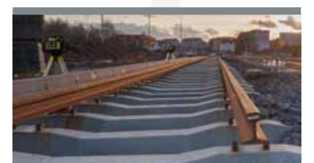
HORIZONTAL, INVISIBLE & FULL AUTOMATIC DUAL GRADE WITH DIAL-IN AND MACHINE COMPATIBILITY