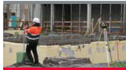
HORIZONTAL & SLOPE