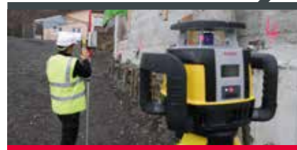
HORIZONTAL & SINGLE GRADE WITH DIAL-IN