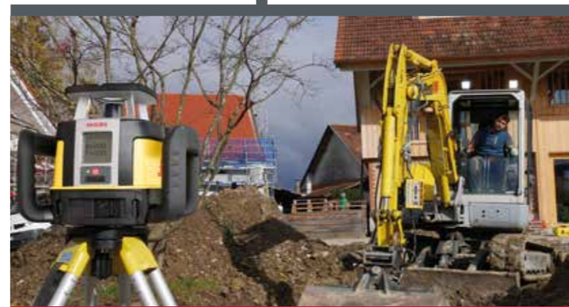
HORIZONTAL, VERTICAL & FULLY-AUTOMATIC DUAL GRADE WITH DIAL-IN AND MACHINE COMPATIBILITY