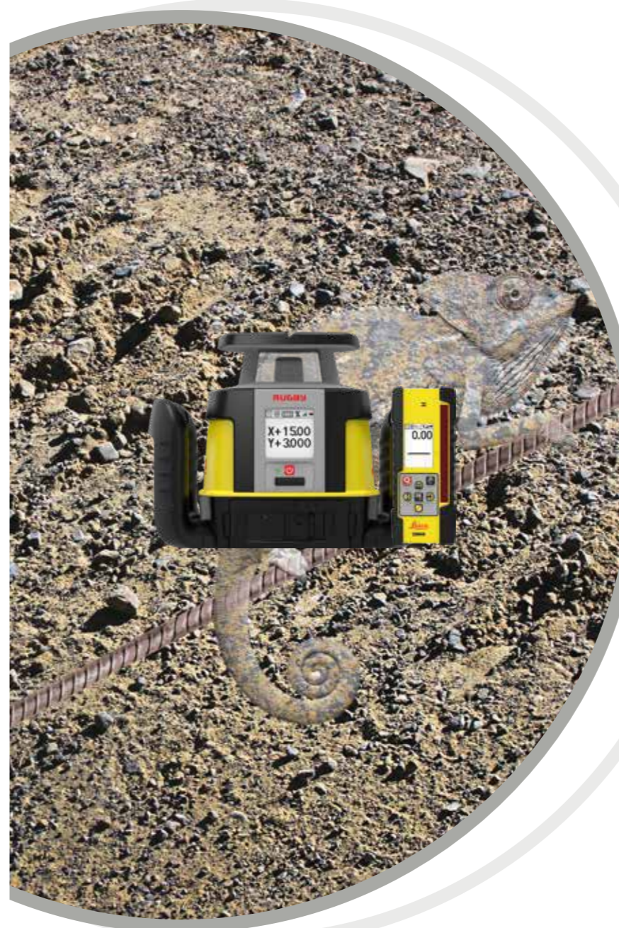
CLI BASE MODEL

The Rugby CLI laser with an invisible beam serves a technology specifically for Rail-, land levelling, excavation and daily construction application. All jobs where invisible beam is required, the new Rugby CLI laser fulfills it with many more professional features such as multiple laser operation max 5 laser with one combo, 20 RPS.