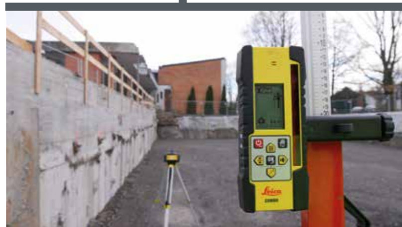
HORIZONTAL & SLOPE LASER