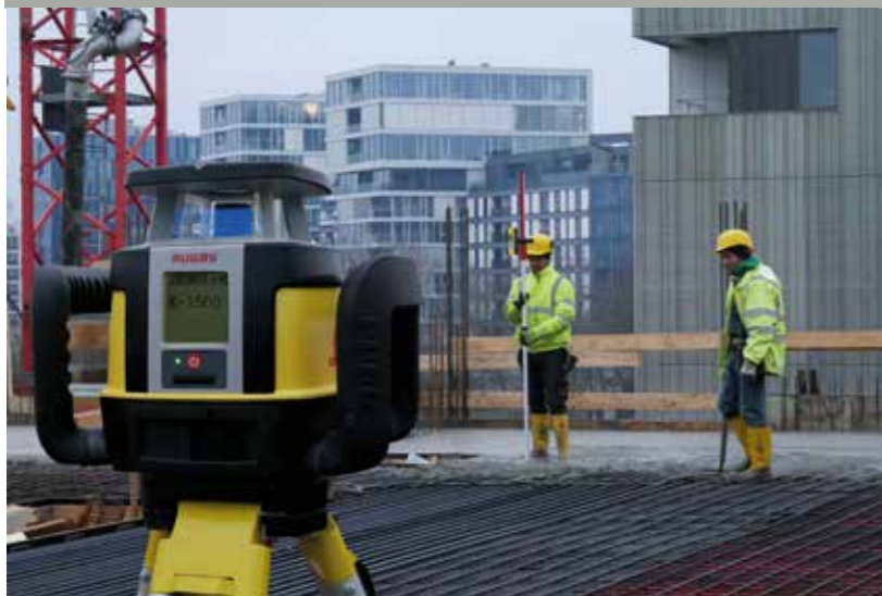
HORIZONTAL, VERTICAL & FULLY-AUTOMATIC SINGLE GRADE WITH DIAL-IN