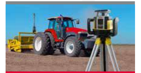
HORIZONTAL, INVISIBLE & FULL AUTOMATIC DUAL GRADE WITH DIAL-IN AND MACHINE COMPATIBILITY