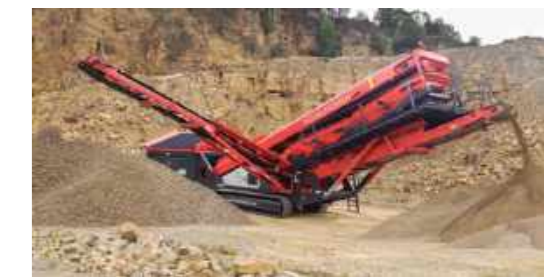
Massive stockpiling capabilities