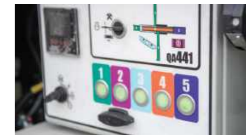
Colour coded control panel for ease of operation