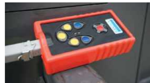
Remote control for ease of mobility