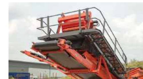
Three sided walkway around main conveyor