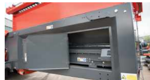
Redesigned feeder hopper for easier access