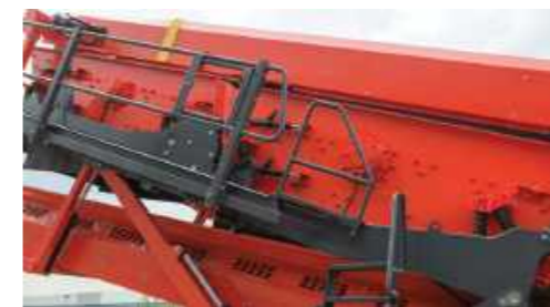
Patented double deck Doublescreen technology