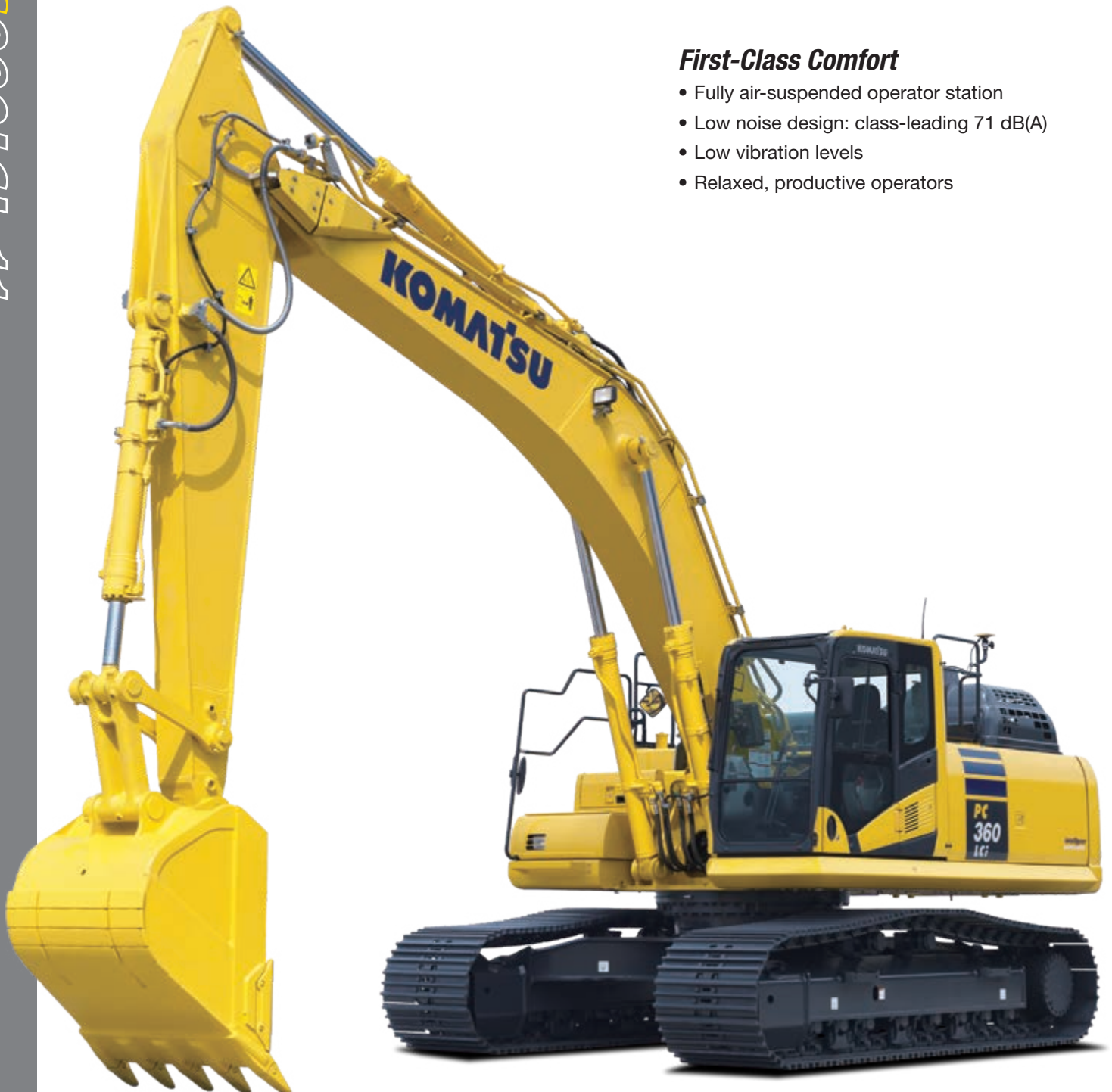
Image shows PC360LC-11 and may display optional equipment or specifications not available in your area.